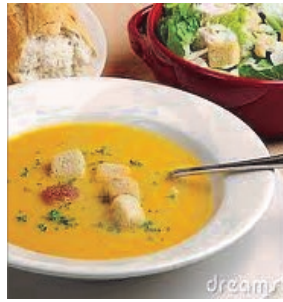
Friday, April 8 after services

The cost is $5 for adults, $3 for children ages 4-12 and free for younger children. Attendees who don't bring soup should bring a side dish to share (enough to feed 10 hungry people): last names starting with A – M please bring a salad; N – Z please bring a dessert. For information or to RSVP, call Temple at 496-0050.